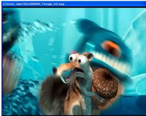
Figure 3.B Scene Change Detection is present.

Figure 3. The visual difference of the quality on 2000 Kbits, 6 noisy frames, for IPP MPEG2 codec with Scene Change Detection (SCD) on and off. (A) SCD is absent. (B) SCD is present.