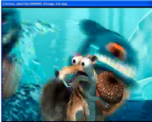
Figure 3.A Scene Change Detection is absent.

codecs with SCD on. We put example of observed visual differences on Figure 3. There are significant blocking artifacts on Figure 3 (a) compared to Figure 3 (b). As the only difference during the coding was the presence of the SCD, it can be concluded, that the analysis of a scene change makes a tangible contribution to the visual quality which can be practically demonstrated with Noisy Frame Insertion technique.