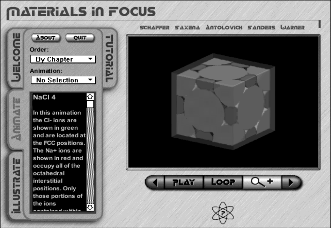
Figure 3. VR clips allowed students to dynamically interact with compound structures giving them a better understanding of relationships and structures.